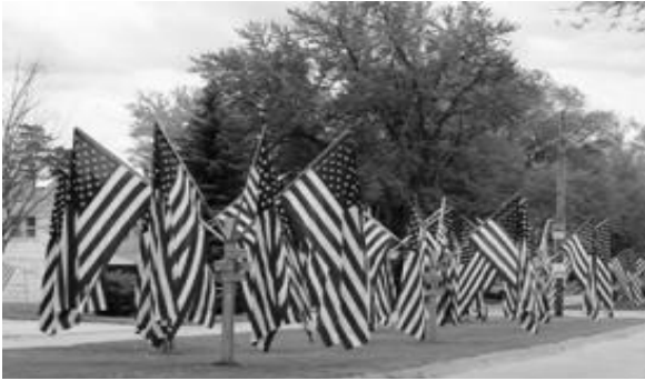
HEMINGFORD'S AVENUE OF FLAGS